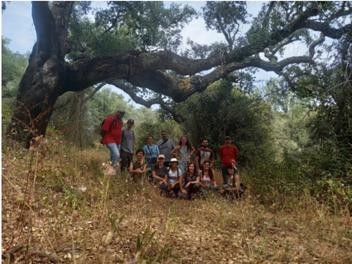
Photo: The Rotmoos valley in early summer 2021

Learn more: Long-term monitoring confirms limitations of recruitment and facilitation and reveals unexpected changes of the successional pathways in a glacier foreland of the Central Austrian Alps (Plant Ecology, https://doi.org/10.1007/s11258-023-01308-2) .