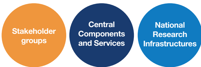
Fig. 1: The Major focal areas of eLTER PPP.